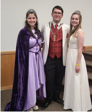
This year's Youth Leaders