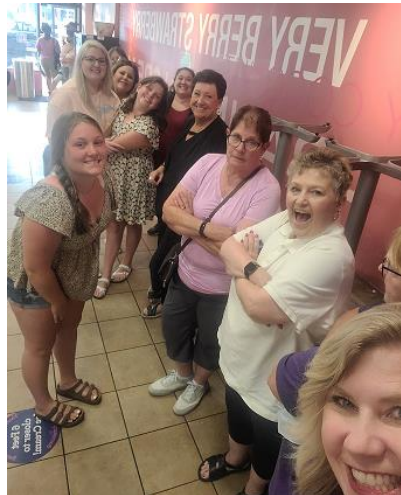
You scream! I scream! We all scream for ice cream!! One of the stops in Virginia.