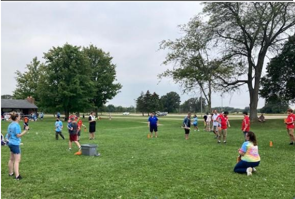
5 F Day and it is kick ball!