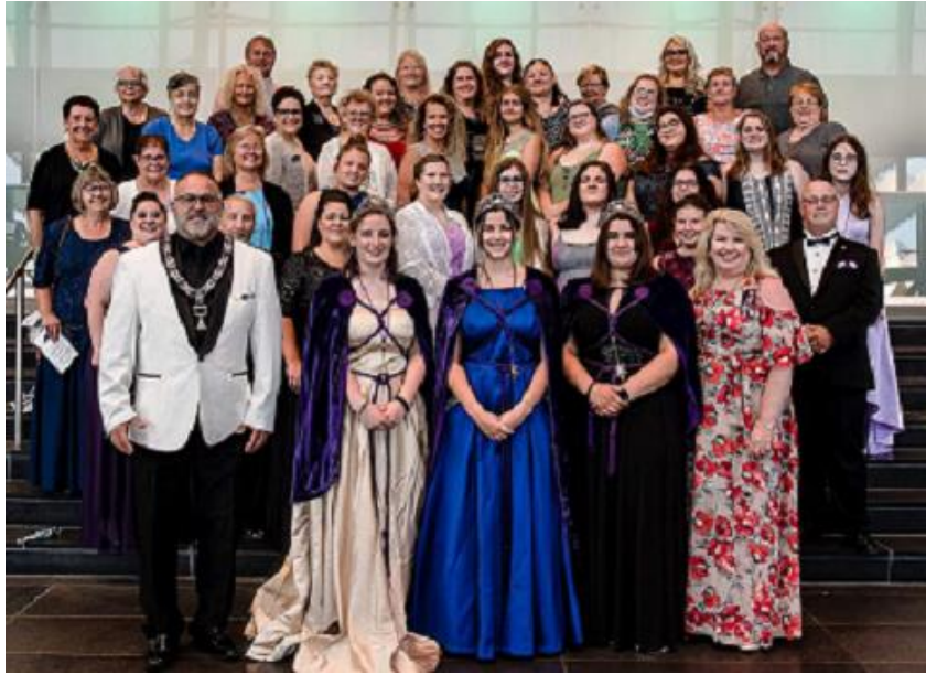
The Jobies in Hampton, Virginia at Supreme Session 2021!