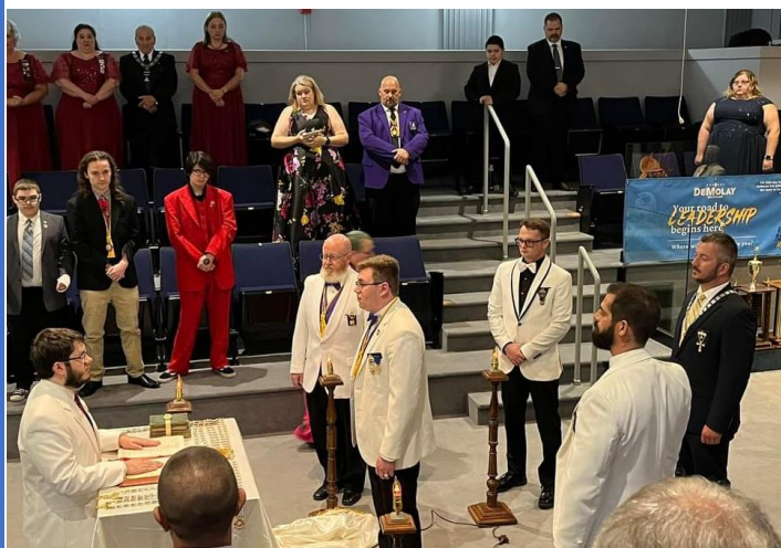
The installation of the State Master Councilor with the Past State Master Councilors around the alter (Pictured Below: Is from our 5 Fs – Fantastic, Fun, Filled, Fall Festival.)