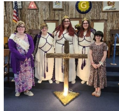
Bethels highlighted are Bethel #10 Grand Rapids, Bethel #30 Grand Blanc, Bethel #82 Allen Park, and Bethel #33 Clio with bonus members from Bethel #23 Walled Lake.