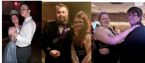
Some nice couples enjoying the dance floor.