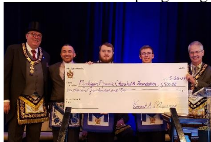
Michigan DeMolay donates to the Michigan Masonic Charitable Foundation.