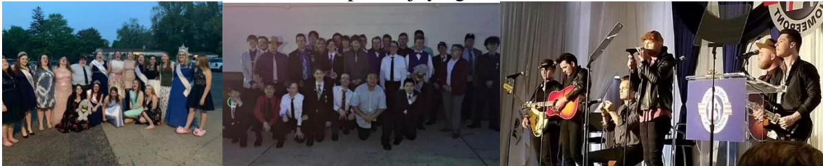
Great Band at the Spring Fling!