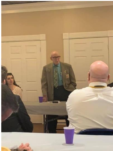
Oldest Sr. DeMolay