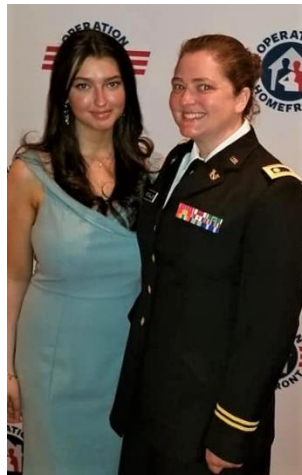
Mother & Daughter