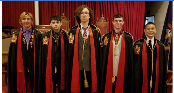
Port Huron New Officers pose after Installation