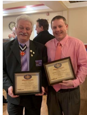
Legacy Certificate holders