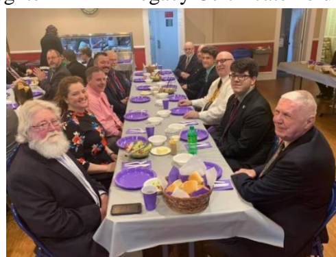
A shot of those who joined us at this dinner.