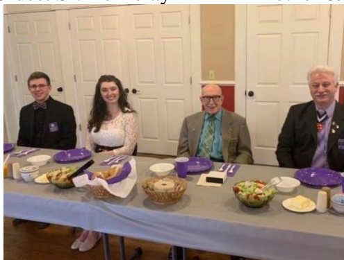
The Head Table at Legacy Dinner