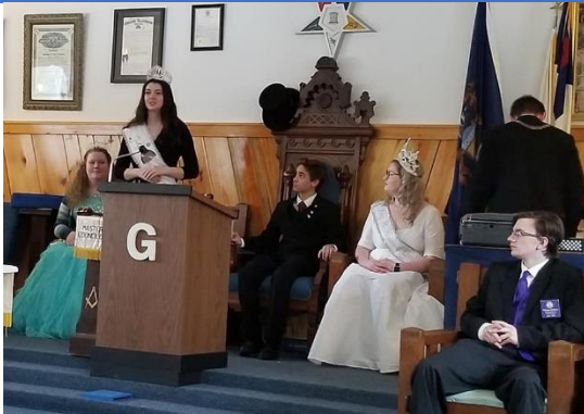
Chain of the Lakes Installation