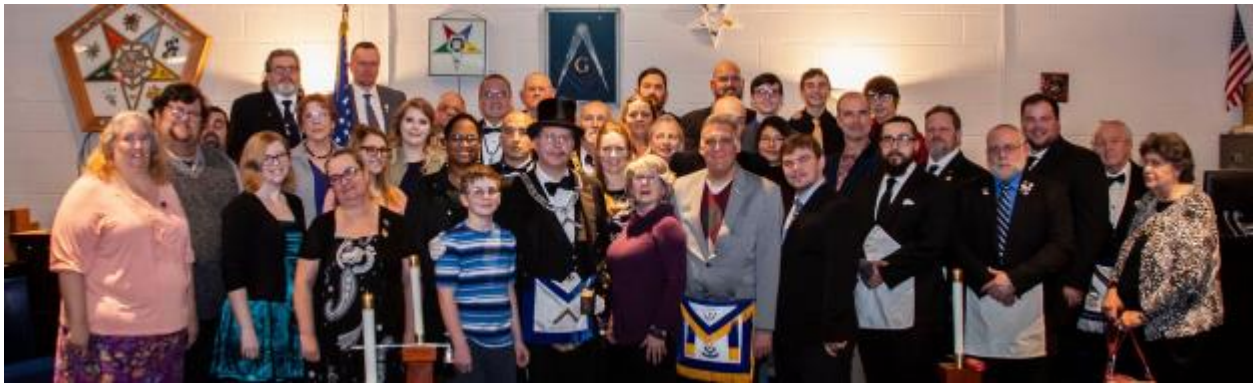
Port Huron DeMolay visiting and supporting Eureka North Warren Lodge