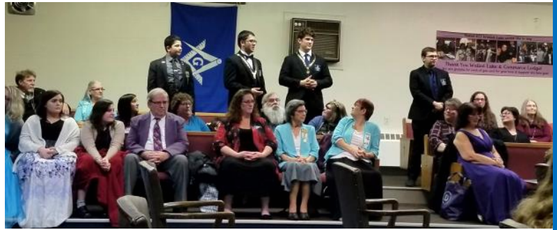
DeMolays supporting their sister organizations.