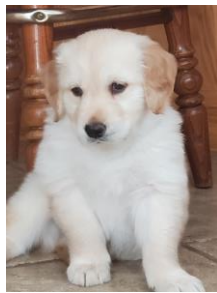
Apollo Splash Heaven