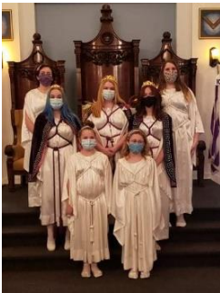
Bethel #10 Grand Rapids

Bethel #30 Grand Blanc just initiated 3 new members on January 3 rd which doubled their membership. Then they held their installation on January 21 st in a beautiful ceremony.