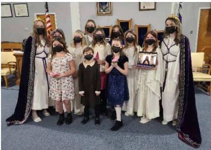
Bethel #82 Allen Park

We look forward to seeing many of you in our travels and remind everyone to Dream and Dream Big.