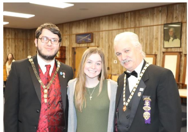
MWGM and two Masonic Youth Leaders: State Master Councilor, Order of DeMolay and Grand Worthy Advisor for Michigan Rainbow.