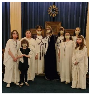
Bethel #52 St. Clair Shores