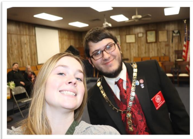
The State Master Councilor and the Grand Worthy Advisor