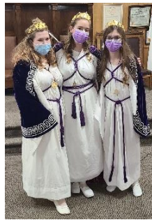
Bethel #61 Mt. Pleasant