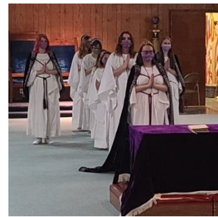
Bethel #30 Grand Blanc