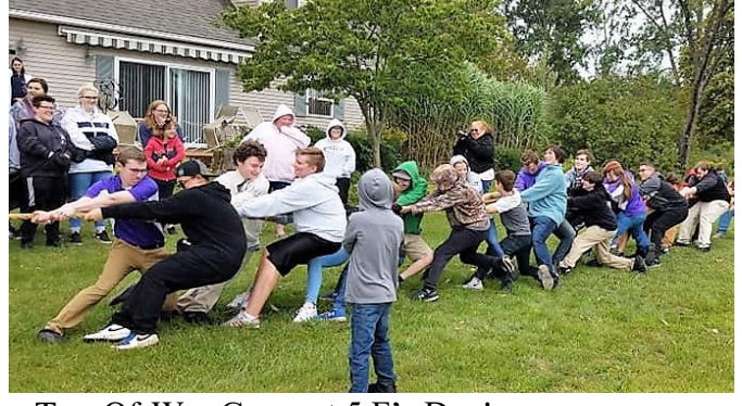
Tug-Of-War Game at 5 F's Day!