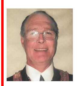
Grand King Is our Grand King okay? I haven't had an article from him in a long time.