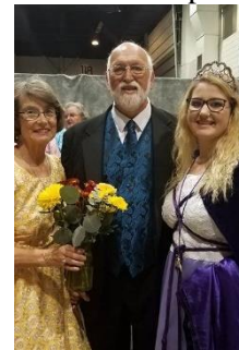
Picture at this year's HIKE walk 2017.