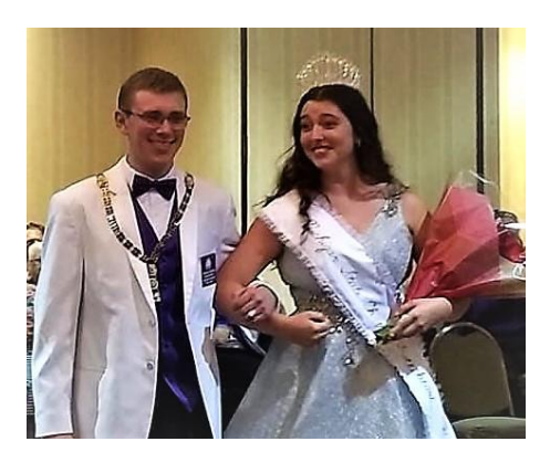
SMC and His SSH