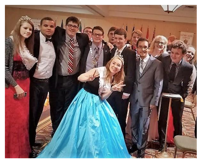
Youth having fun at the conclave