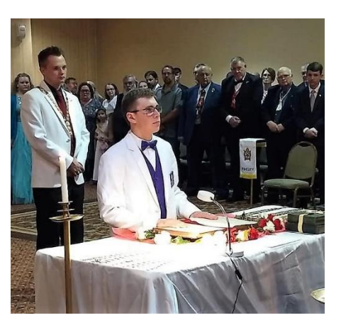
Taking the Obligation