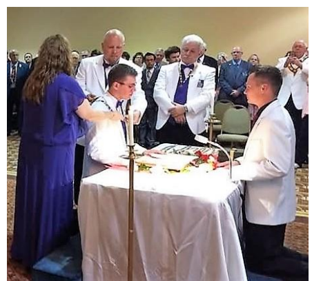
Being collared by Parents