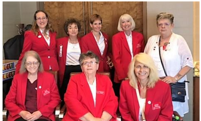
Please meet your Grand Chapter Royal Arch Ladies of Michigan 2016-2017