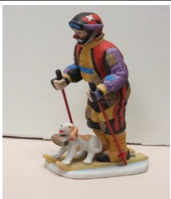
Number Three is 7 ¾" tall