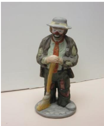
Number Two is 8 ¼ "tall