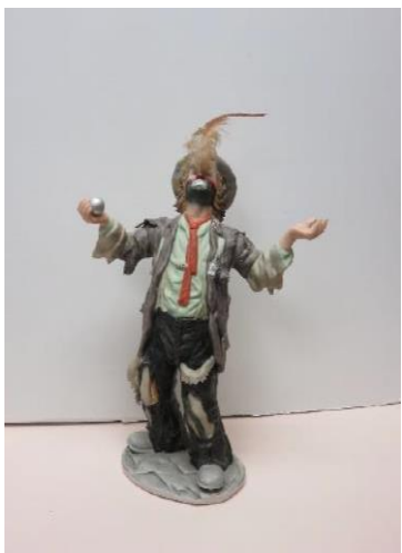
Number One is 10" tall