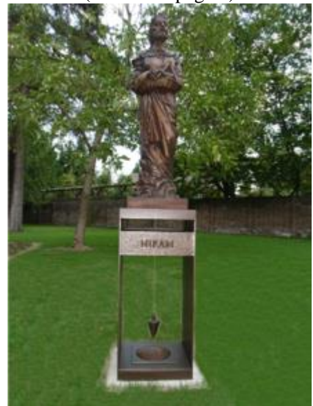
A bronze statue in Germany 2013 Of King Hiram Abiff.